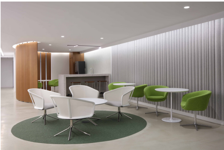
Volunteers of America