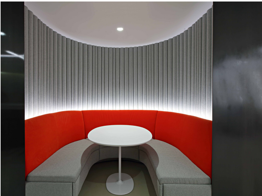
Volunteers of America