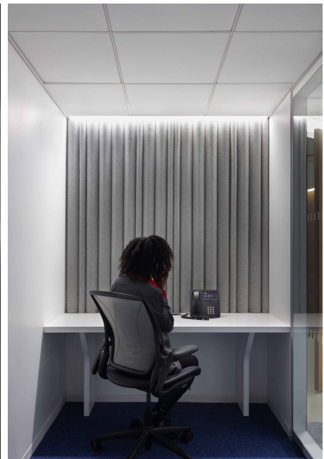
Volunteers of America