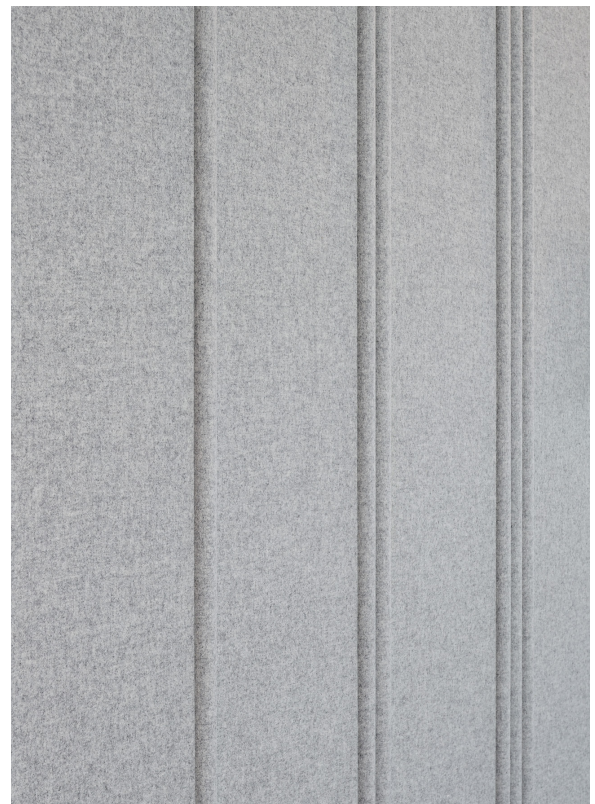
SWELL 3 Pattern 1, 2, 3

This acoustical substrate is made from inorganic glass mineral wool, and has excellent sound absorption characteristics.