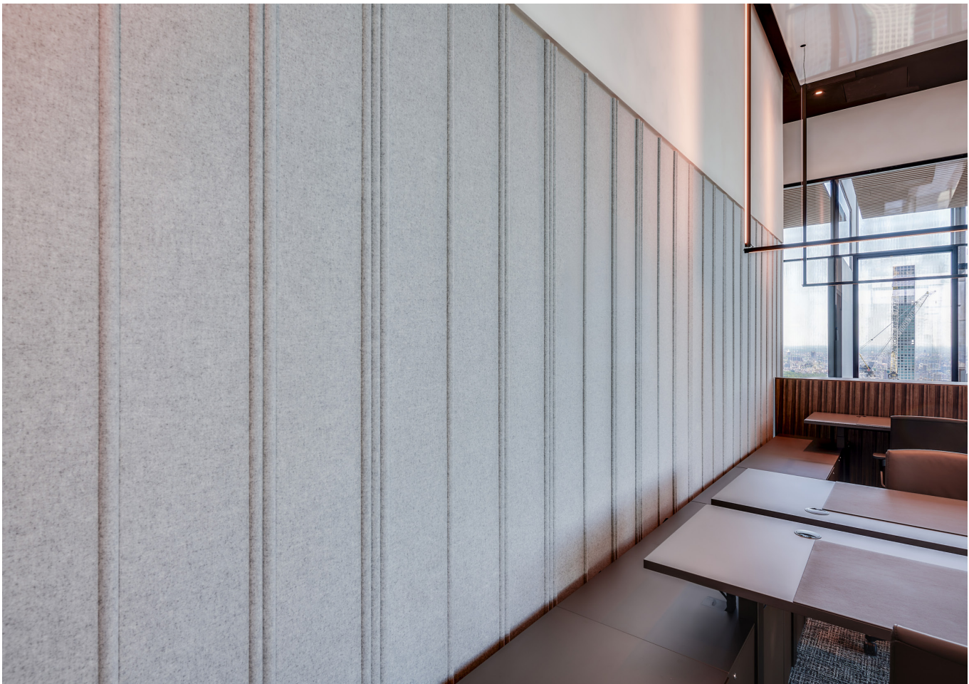
GFL 12" wide panels